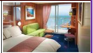
露臺海景客房 Balcony Cabin

團費 (兩人一房) / 人 Tour Fare (Twin Share) / pax