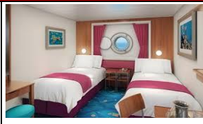
海景客房 Oceanview Cabin