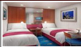
內側客房 Inside Cabin