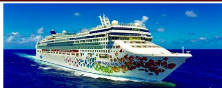
挪威珠寶號郵輪 Norwegian Gem